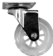
C x 4 (11060)