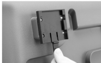
A. Hold the plastic tab down on PLASTIC PLATE (A) .

Insert WHEELS (C) . Reverse this step to detach wheels.