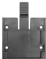
A x 4 (11042)