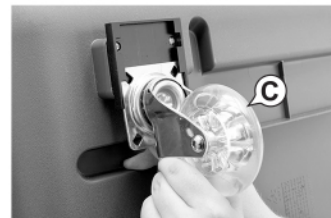
B. Slide WHEEL (C) in while holding plastic tab down.