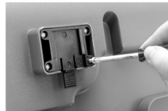
B. Remove screws with a Phillip's head screwdriver.