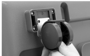
A. Hold the plastic tab down and slide wheel out.

Turn kennel onto side. Remove current wheel plates.