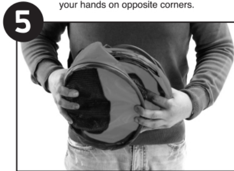
5 Position the three layers one on top of the other, to form a compact round shape.