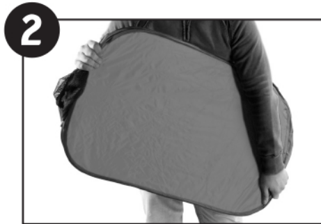
2 Hold kennel flat against your body with your hands on opposite corners.