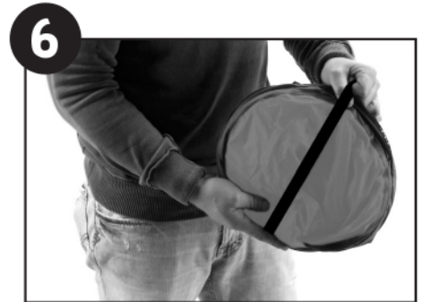
6 Finally, slide the elastic band over the kennel.