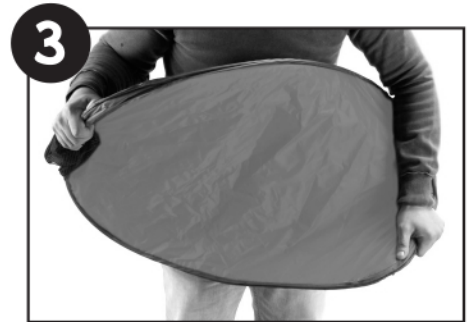
3 Twist kennel in opposite directions, pushing inwards.